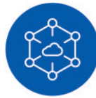
System Integration and Collaborative Capabilities