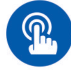
Intelligent Control System