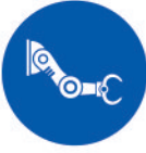
Laser Welding Technology

INTEGRATED SOLUTION FOR INTELLIGENT EQUIPMENT IN NEW ENERGY INDUSTRY