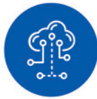
Data Management and Traceability Capabilities