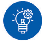
Continuous Innovation and R&D Capabilities