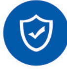
Quality Control Technology