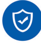
Quality Control Technology