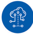
Data Management and Traceability Capabilities